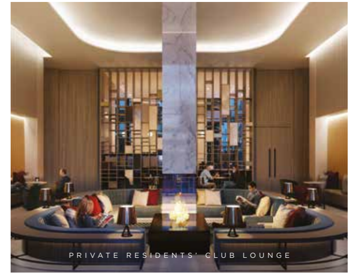
PRIVATE RESIDENTS' CLUB LOUNGE