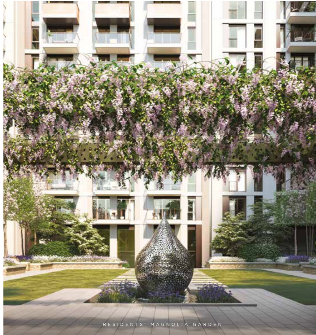
RESIDENTS' MAGNOLIA GARDEN