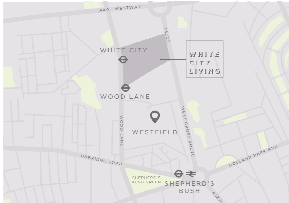
Maps are not to scale and show approximate locations only